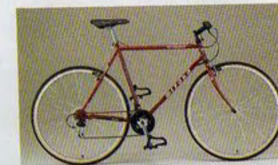
Frame Color YS-742 (Dark Brown)