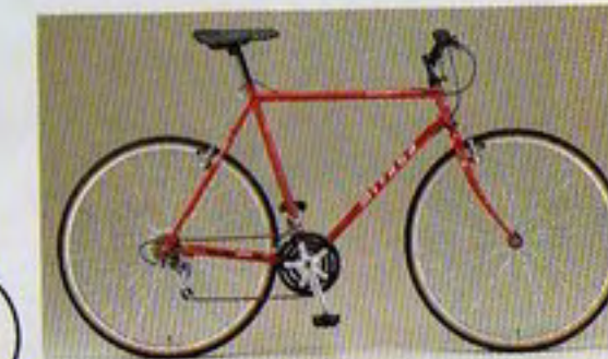
Frame Color YS-741 (Red)