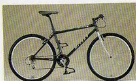
Frame Color YS-856/YS-716 (Dark Green/Silver)