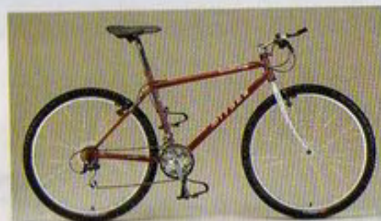
Frame Color YS-742/YS-716 (Dark Brown/Silver)